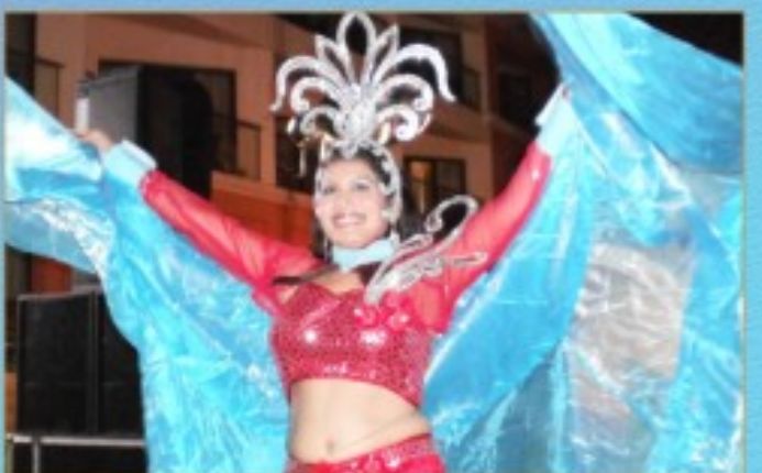
NATCON IASO 2012