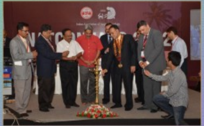
Inauguration NATCON IASO 2012